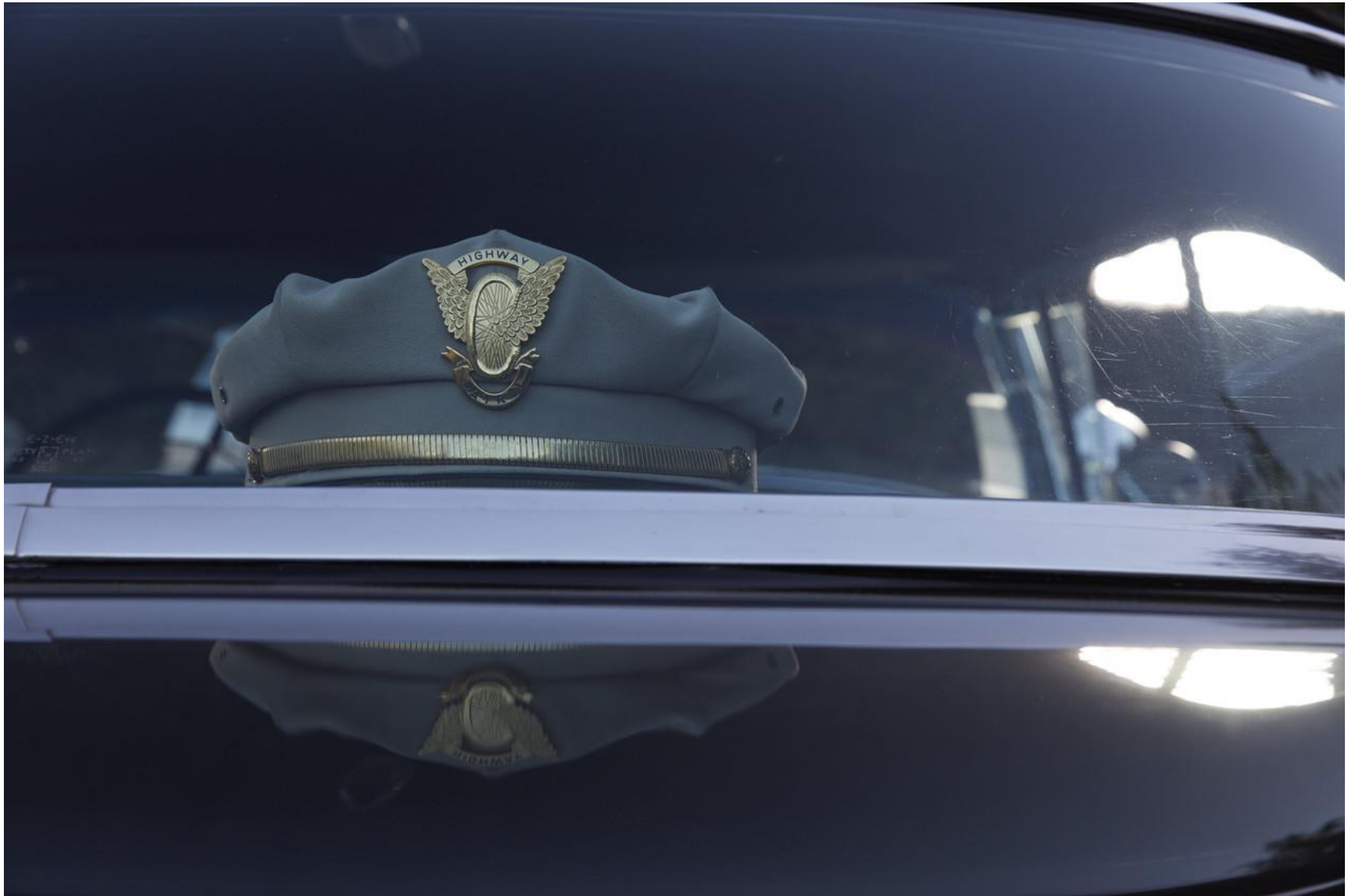
An old highway patrol hat completes the package.