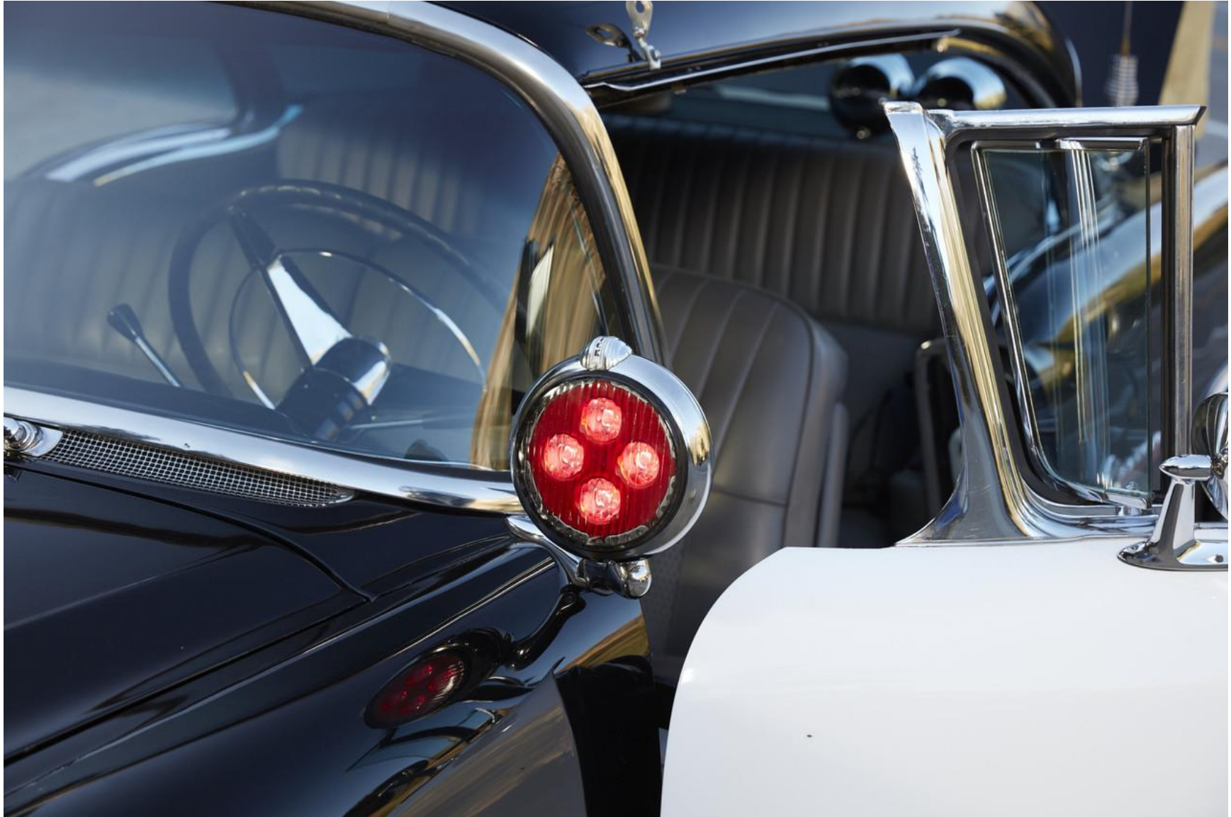
Some detail of the policing equipment. The TV show 'Highway Patrol' ran original episodes from 1955 to 1959, according to the Internet Movie Database, with reruns airing after that.