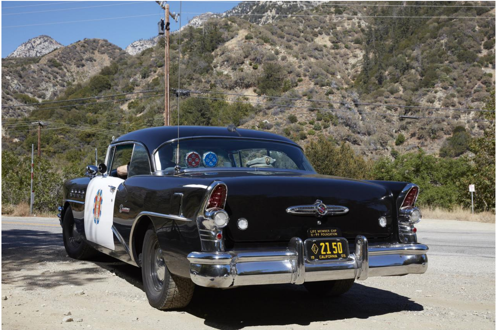
The car from behind, showing the 2150 license plate—Broderick Crawford’s car number on the show ‘Highway Patrol.’ ‘Growing up in Pittsburgh and watching that show, the cars looked so different from what police drove where we lived,’ says Mr. Goltz.