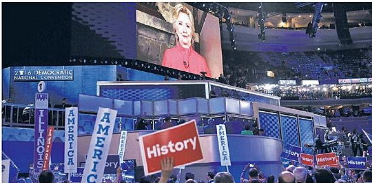
Hillary Clinton addressed the Democratic convention via video feed late Tuesday, topping off a string of speakers that included her husband, former President Bill Clinton.