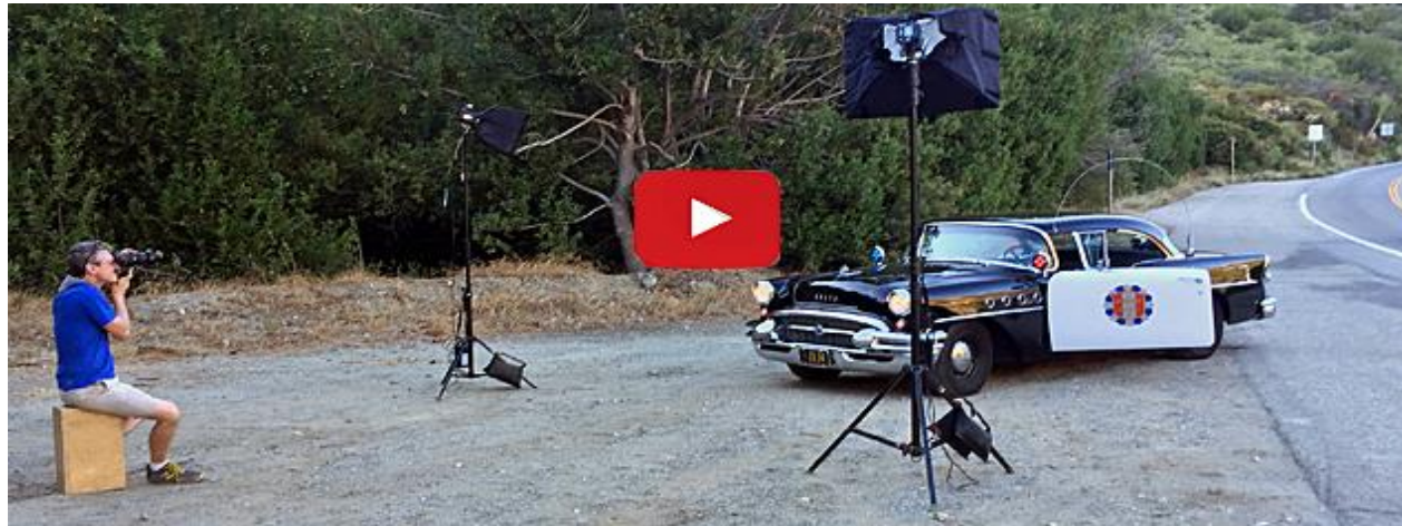
Behind the scenes of the WSJ Photo Shoot.

I've owned this car now for 21 years. Every time I take it out, it still draws a crowd.