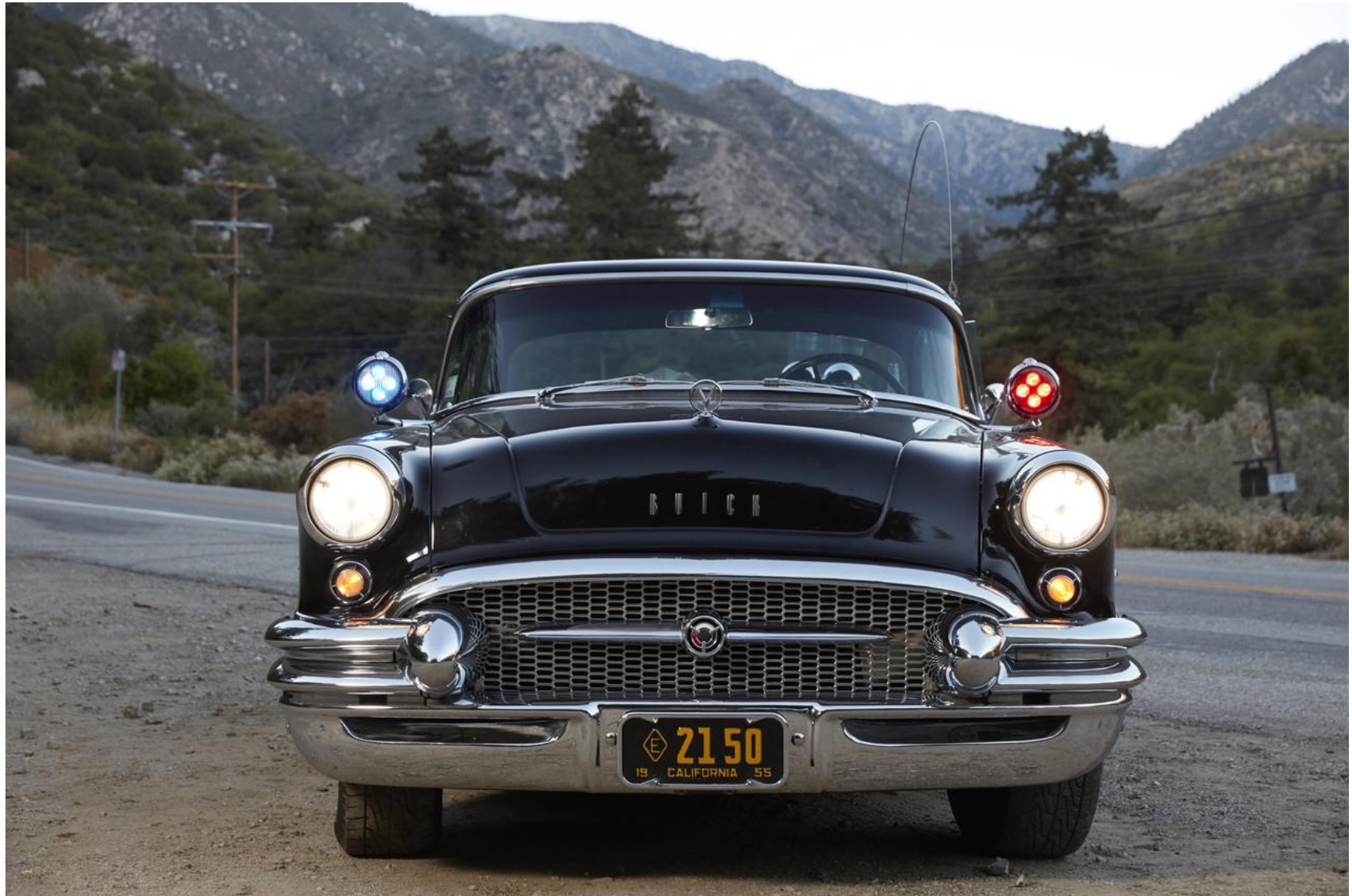
The car's prodigious nose. There's enough chrome on this vehicle to keep its owner busy buffing for hours.