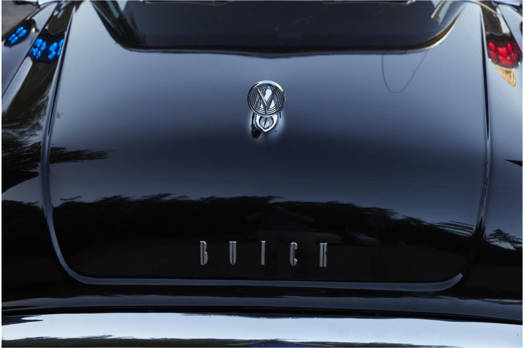
The hood ornament and the Buick logo—classic 1950s styling.