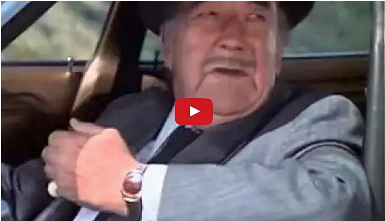
Broderick Crawford getting pulled over on CHiPs in 1977.

As a kid growing up in the 1960s, I loved the TV show “ Highway Patrol .” Every day I’d come home from school, have a peanut butter sandwich and watch Broderick Crawford in that show, followed by “The Three Stooges” and “Popeye” cartoons. “Highway Patrol” was all about good guys winning over bad guys. Watching that heavysset cop in a fedora driving a Buick California Highway Patrol car and ordering people around—there was something mesmerizing about him.