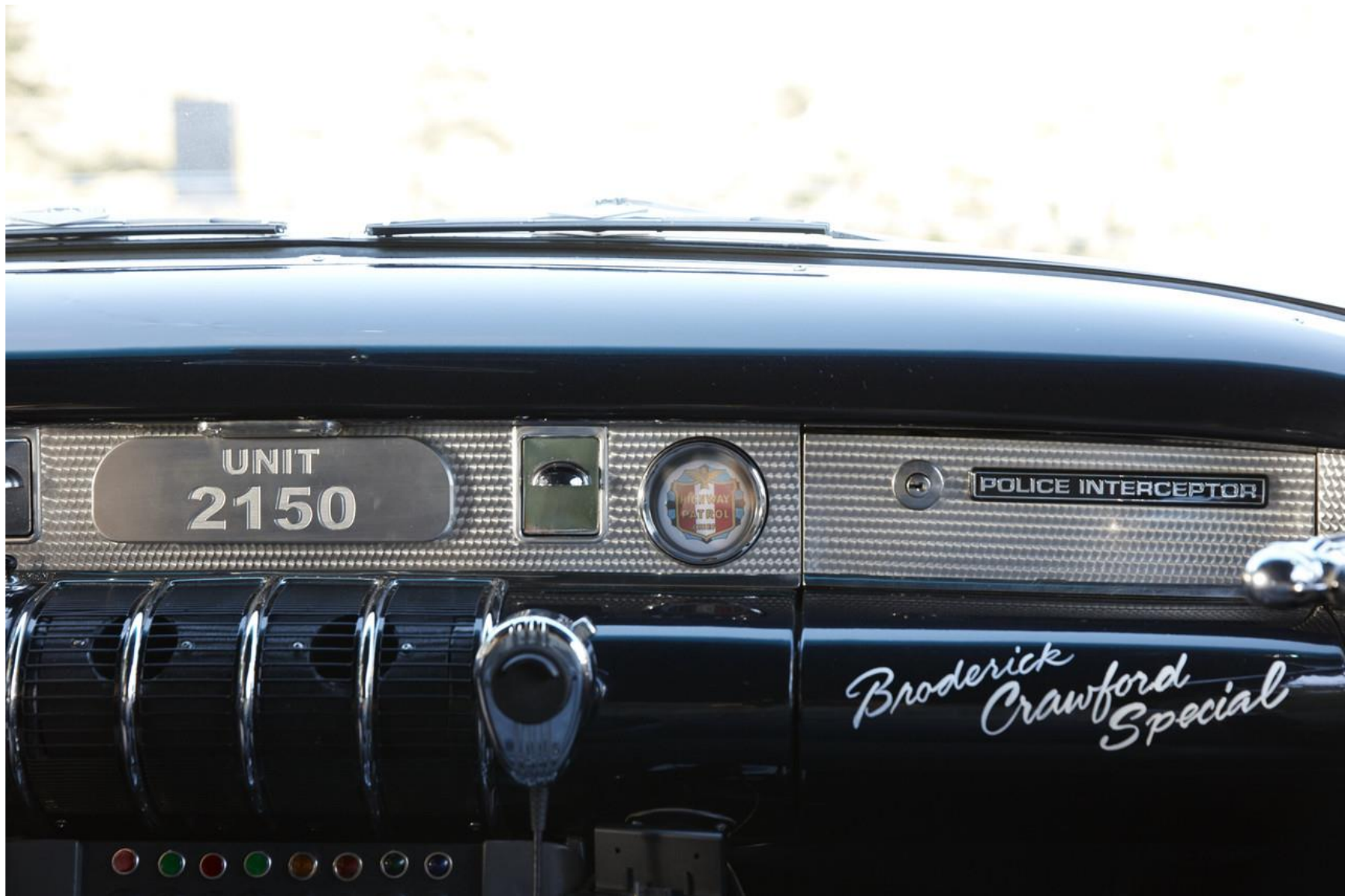
Unit 2150 was Broderick Crawford's car number on 'Highway Patrol.' 'Talk to anyone over 60 about that show and they'll get a big smile on their face,' says Mr. Goltz.