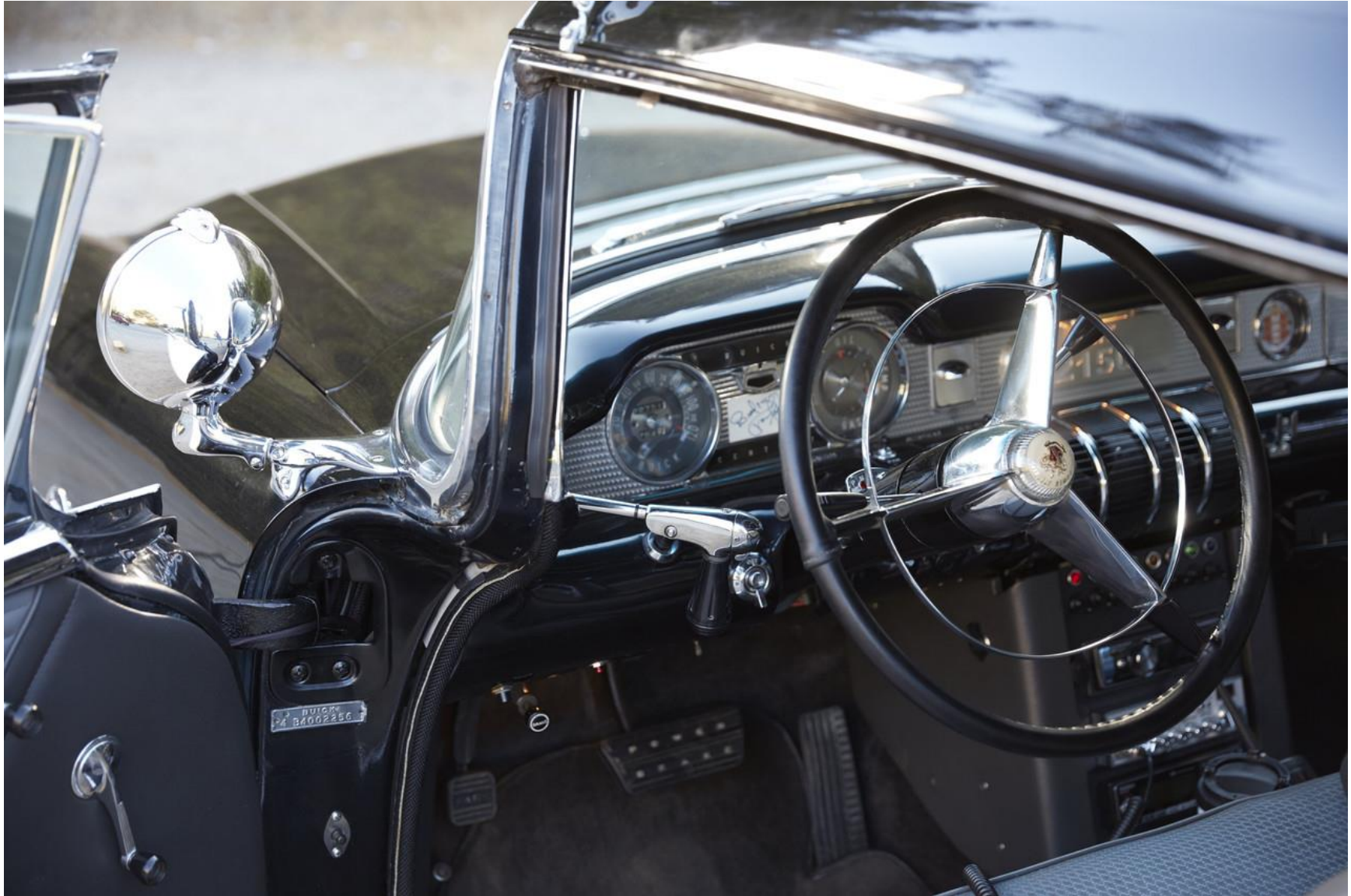
A peek into the car's interior. The Buick was not a cheap car in 1955, and the interior featured elegant art-deco styling.