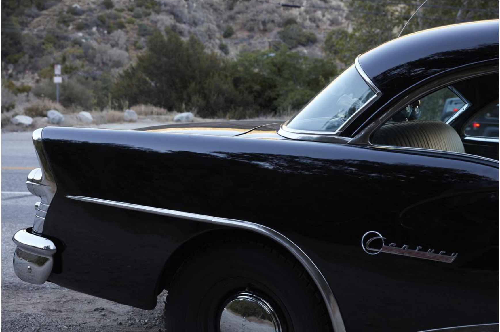
More detail of the 1955 Buick. It was a slightly odd choice for a police car in the 1950s because it was expensive. 'The Buick was the car doctors drove,' say Mr. Goltz.